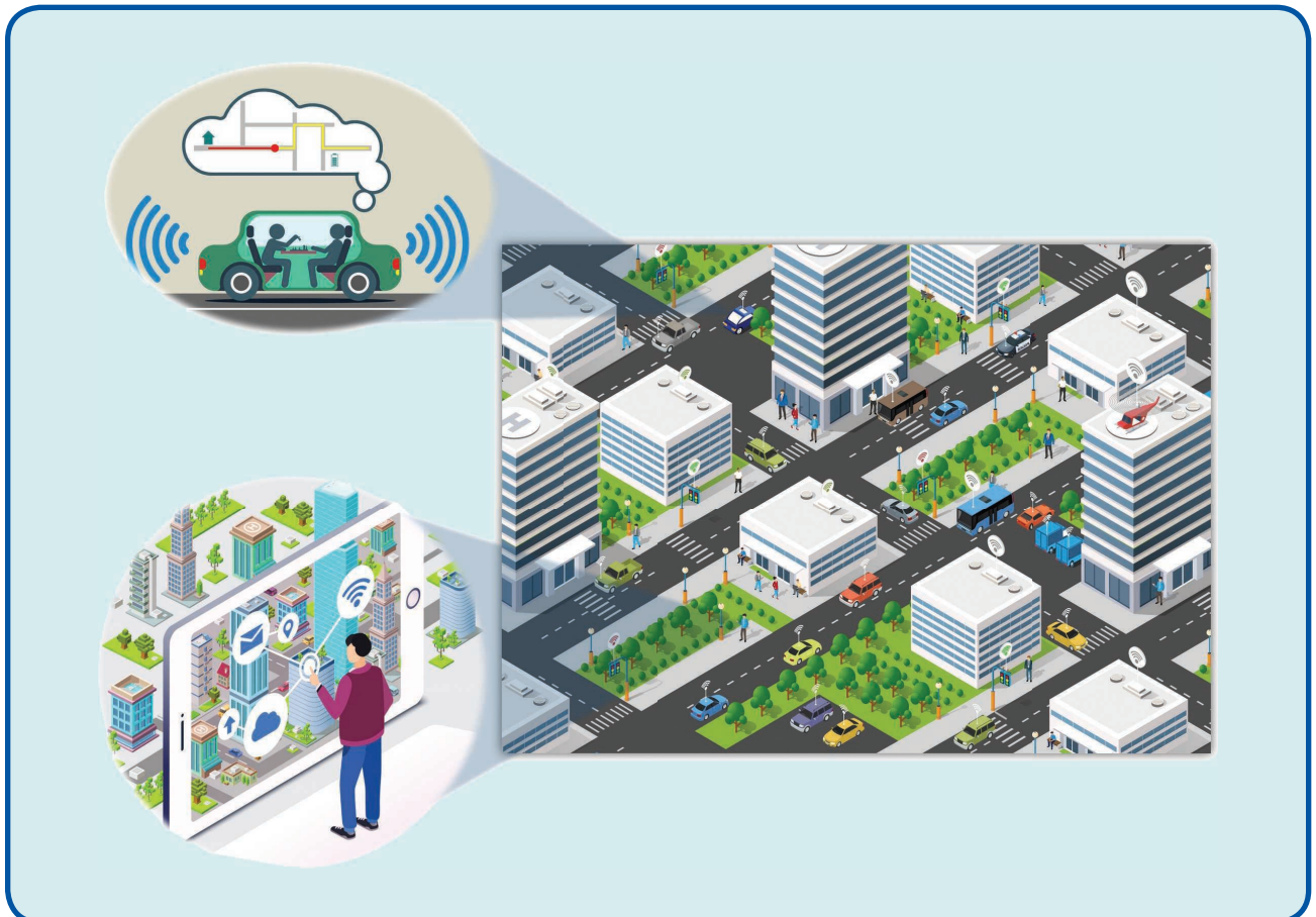
FIG 1 A view of a city enhanced by connectivity and automation.

Shared mobility includes a variety of service models (e.g., carsharing, ridesharing, bikesharing) to meet travel needs and may result in a transformative impact on urban mobility [4]–[8] and landscape. As shared mobility services evolve, there has been a debate on their potential impact [7], [9], [10]. The advent of intelligent transportation systems and information technologies has aimed at facilitating shared mobility services (Fig. 1). In this context, impact analysis of the introduction of connected vehicles and automated vehicles (AVs) into existing shared mobility services is vital to identify the opportunities and challenges related to a shared autonomous mobility system. In this paper, we review the research reported in the literature on carsharing enhanced by vehicle